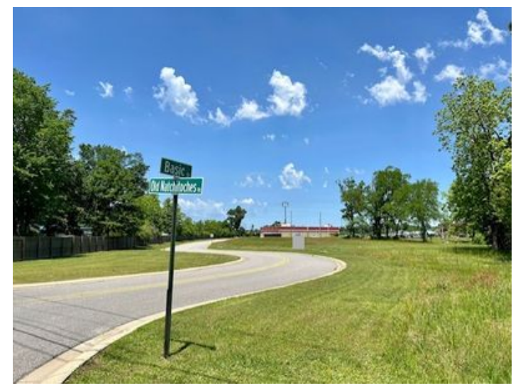
Corner of Basic Dr/Old Natchitoches