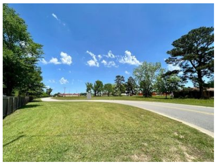
Adjacent 1.44 +/- Acre Lot Available