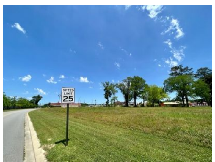
Lot 1A 1.44 +/- Acres