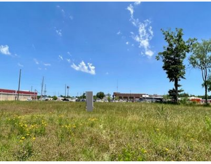
Lot 1B 1.55 +/- Acres