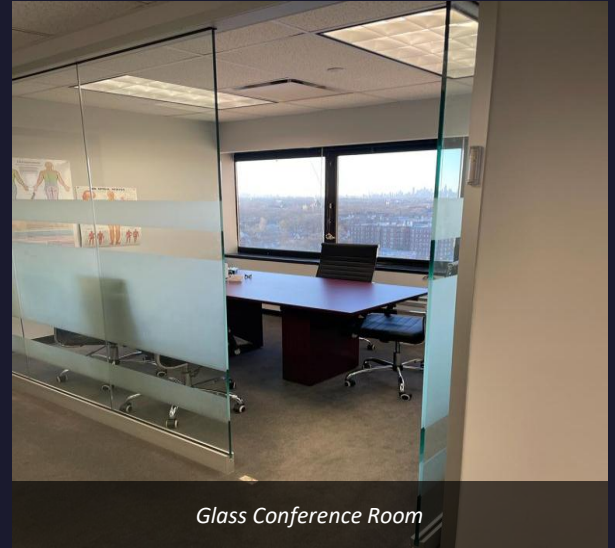
Glass Conference Room