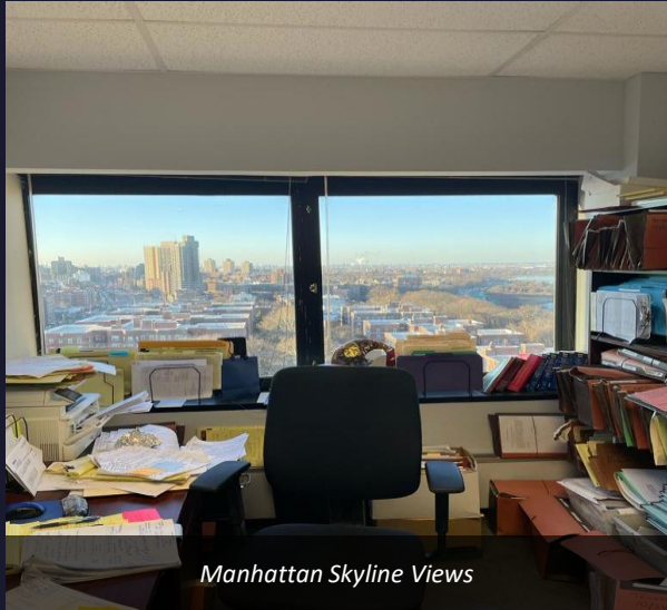
Manhattan Skyline Views