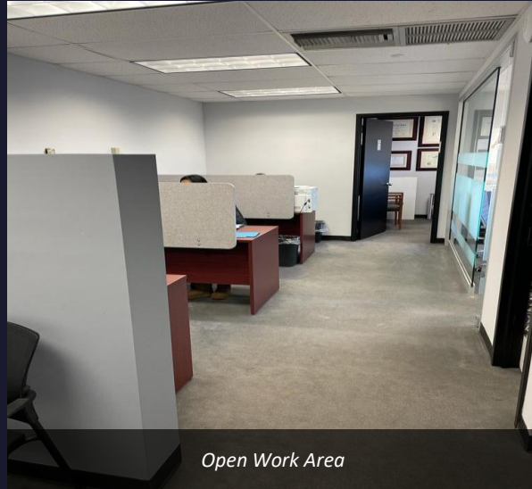
Open Work Area