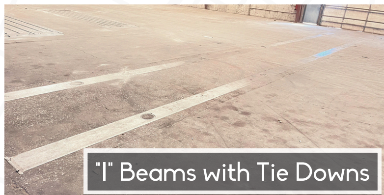
"I" Beams with Tie Downs