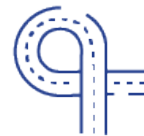
Quick access to I-40 and I-240