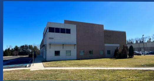
2000 LINCOLN DRIVE