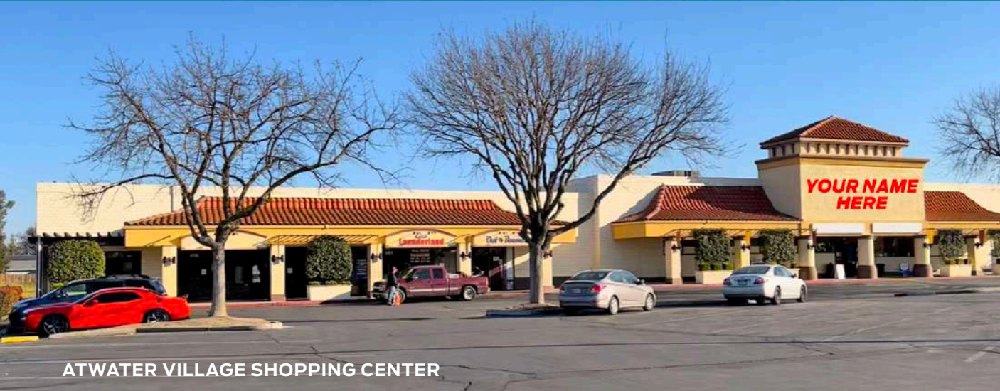
ATWATER VILLAGE SHOPPING CENTER