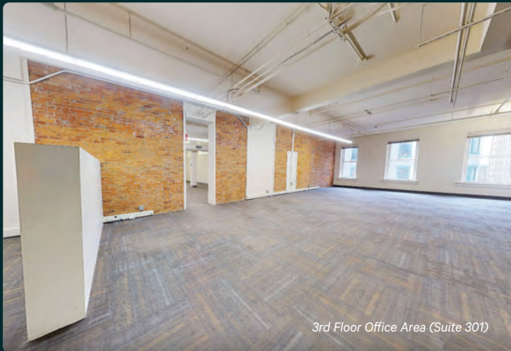
3rd Floor Office Area (Suite 301)