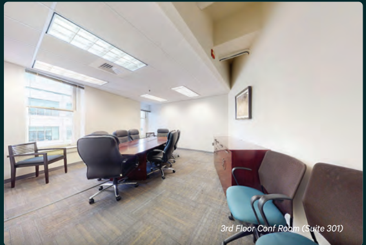
3rd Floor Conf Room (Suite 301)