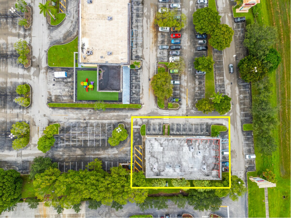
Untitled design (5)