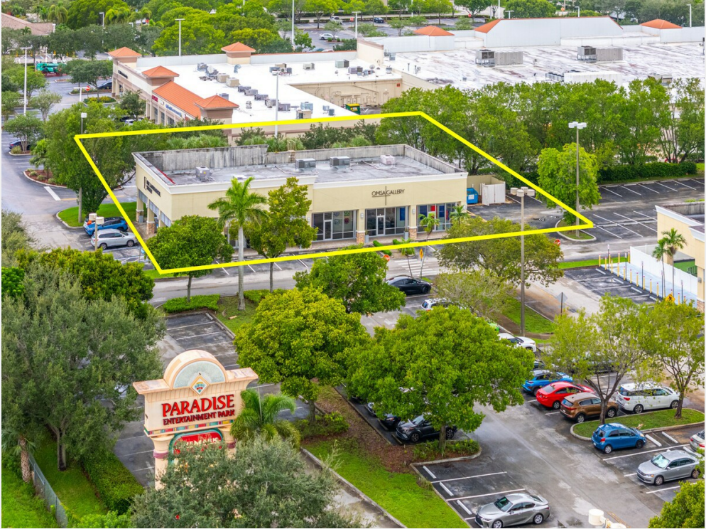
Untitled design (4)