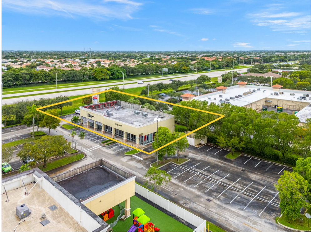
Untitled design (1)