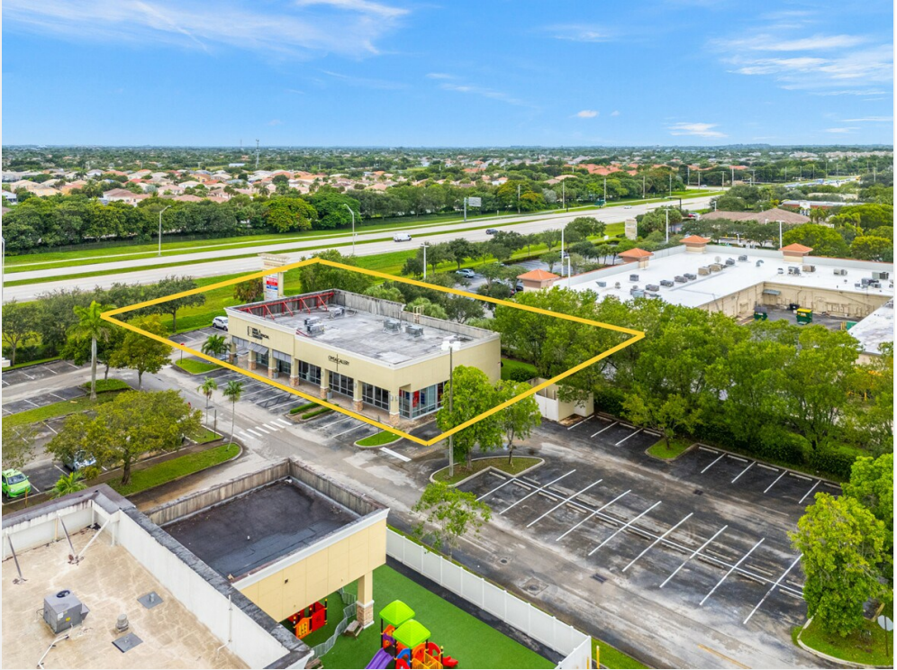
Untitled design (2)