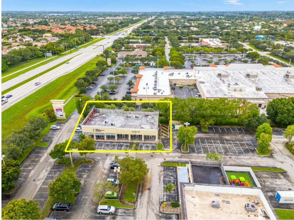
Untitled design (3)