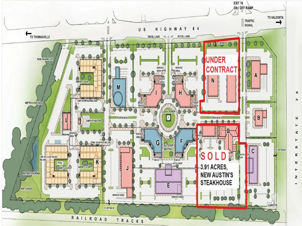
Austin's SOLD, LOT N PENDING concept plan