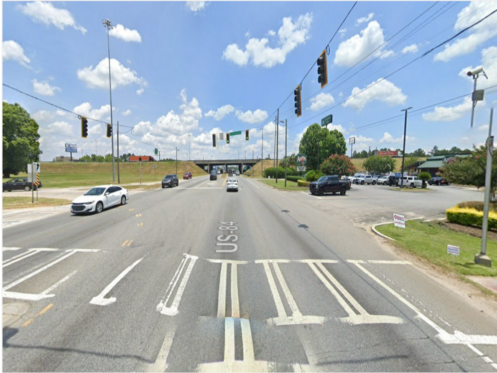
4-way signaled intersection at site