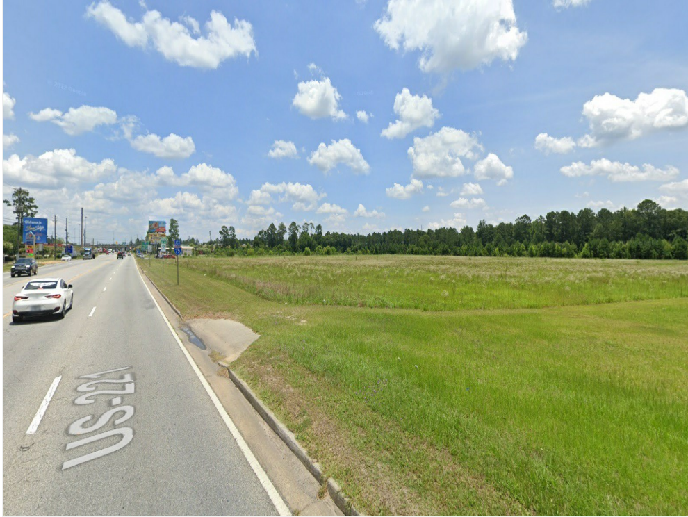
West end looking east to I-75