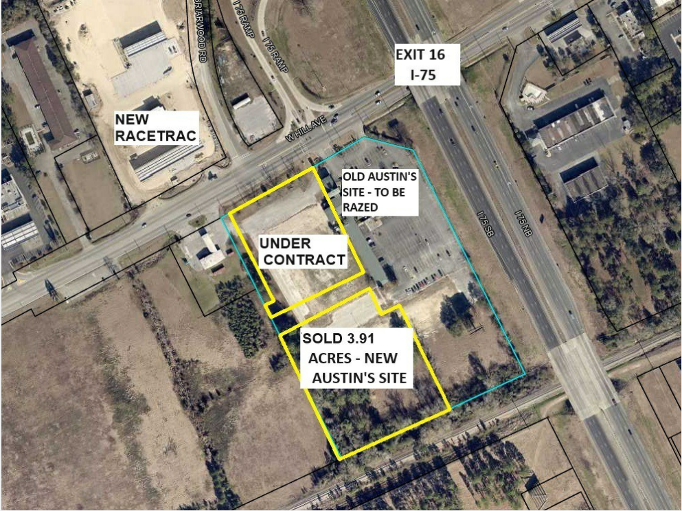
Austin's New Site aerial etal