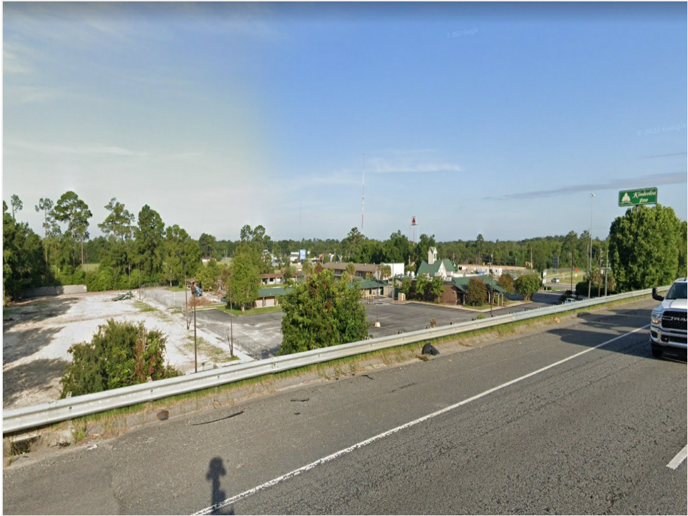
I-75 NW to site