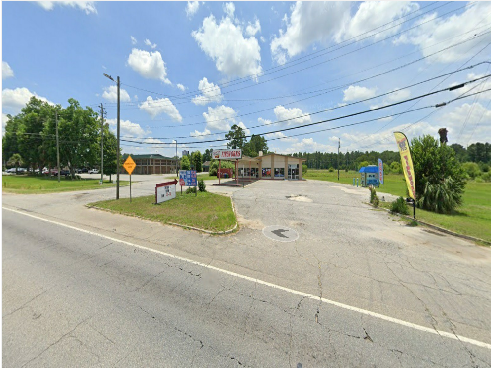
Fireworks Bldg entry-exit