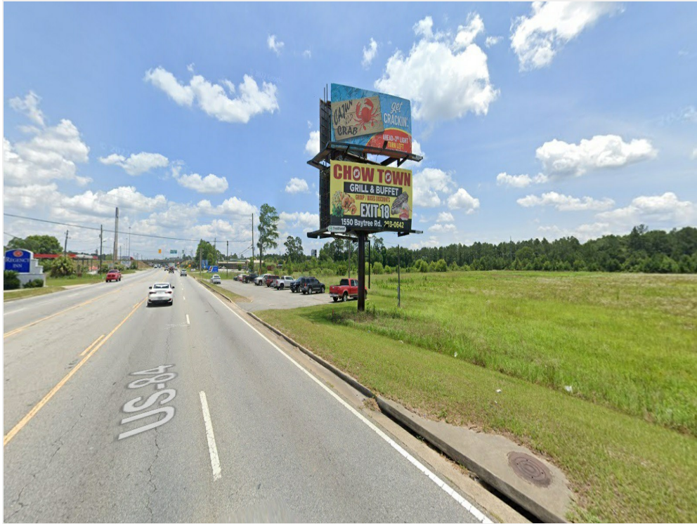
Mid-frontage billboard & GDOT parking lot