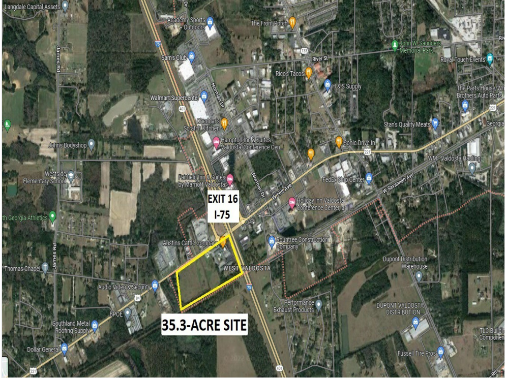
Aerial zoom out