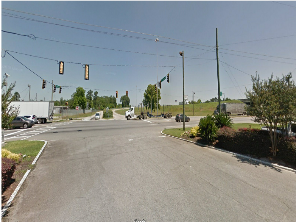
Signaled entry-exit from site across from on-off ramps