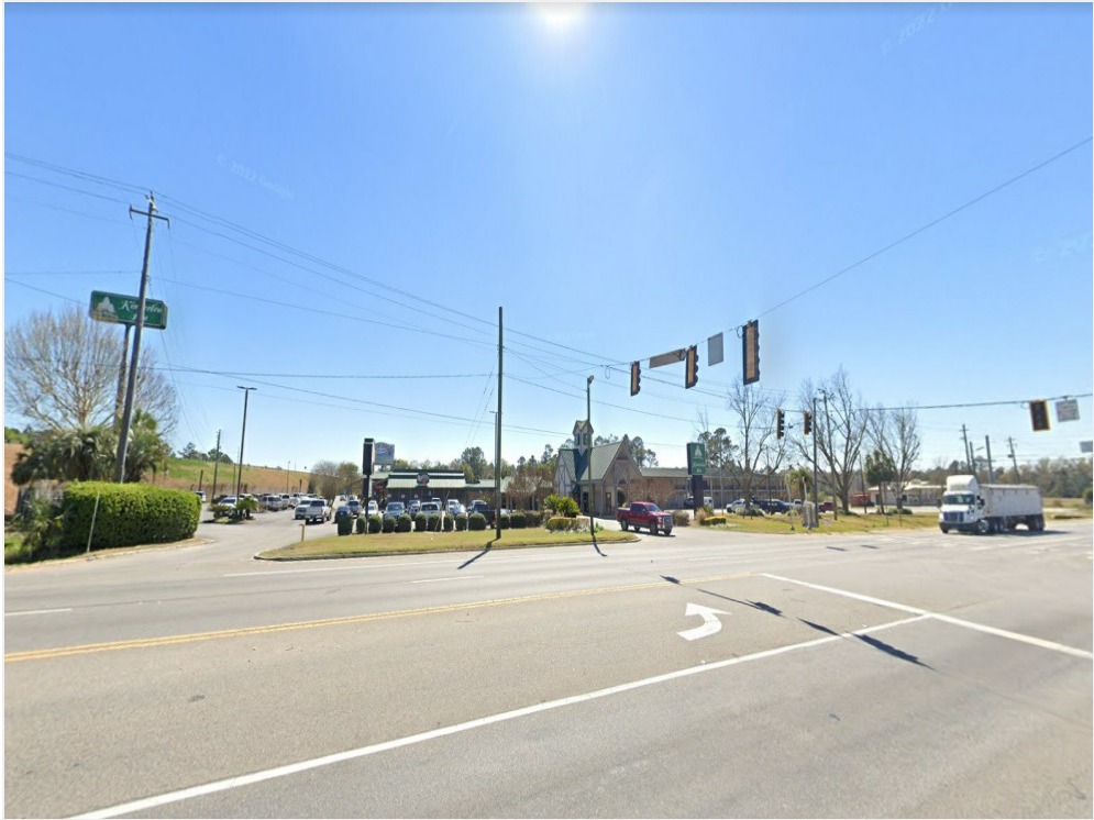
Main street frontage