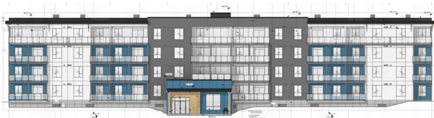
BLOCK A - SOUTH ELEVATION