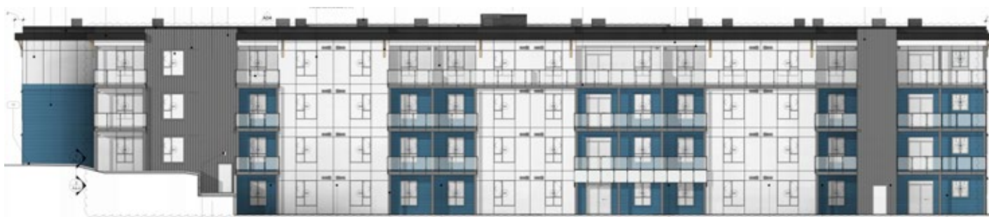
BLOCK A - NORTH ELEVATION