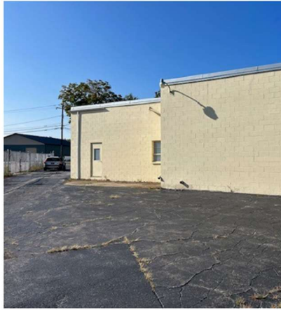
Side parking area Slop sink area