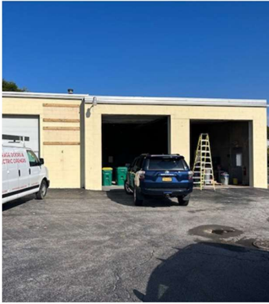
Easy access with 12x12 overhead doors Warehouse storage area