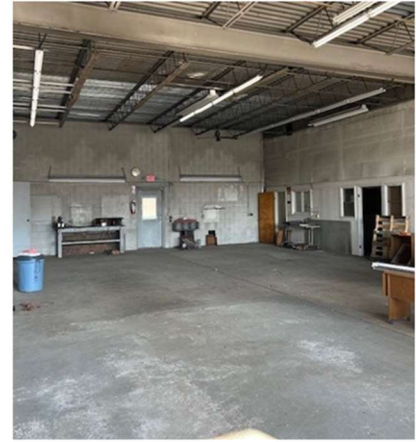
Open warehouse with 13' ceiling Kitchenette