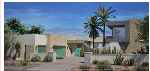
Site Plan and Community Renderings

760.360.8200 | DesertPacificProperties.com | 77-933 Las Montanas Rd. Suite 101 Palm Desert CA 92211