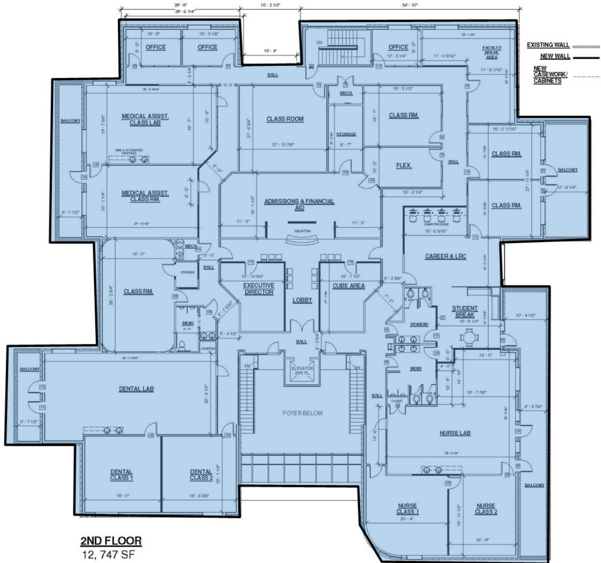
2ND FLOOR 12, 747 SF