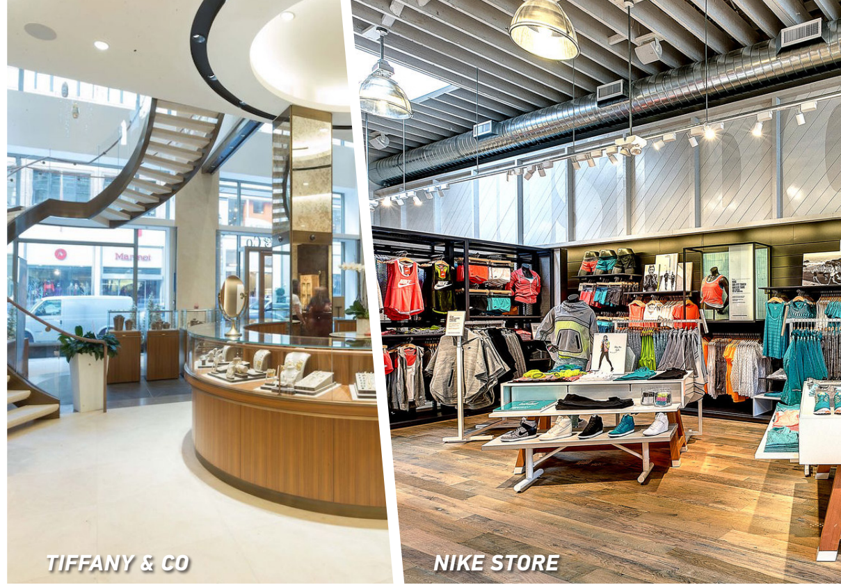
TIFFANY & CO