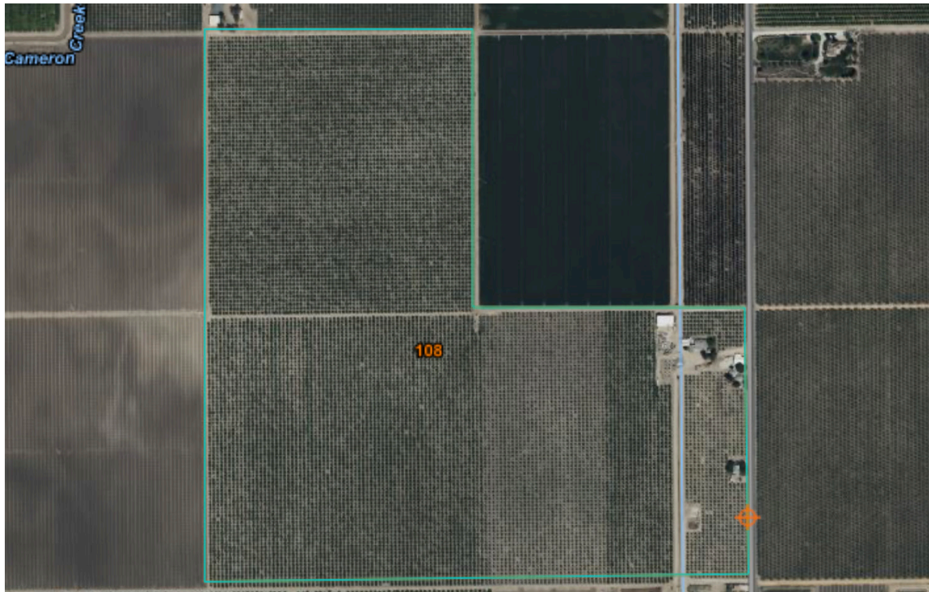
Soil: Colpien Loam - 0-2% Slopes