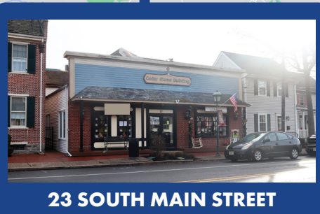
23 SOUTH MAIN STREET