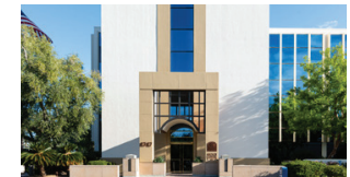
4747 4747 N 22nd St Phoenix, AZ 85016