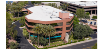
7250 7250 N 16th St Phoenix, AZ 85020