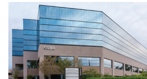
5080 5080 N 40th St Phoenix, az 85018