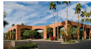
4040 4040 E Camelback Rd Phoenix, AZ 85018