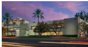
2141 2141 E Camelback Rd Phoenix, AZ 85016

Office: 602 - 956 - 2200 Cell: 480 - 297 - 9481