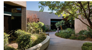
SOP 3923-4041 S McClintock Rd Tempe, AZ 85282