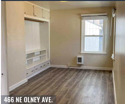
466 NE OLNEY AVE.