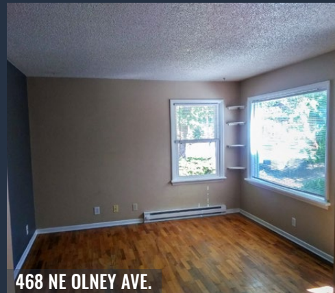
468 NE OLNEY AVE.