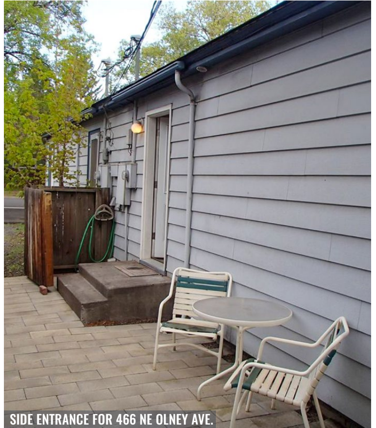
SIDE ENTRANCE FOR 466 NE OLNEY AVE.