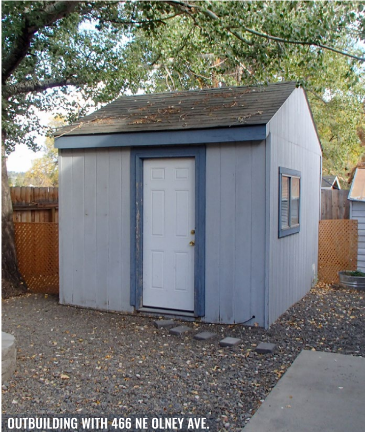
OUTBUILDING WITH 466 NE OLNEY AVE.