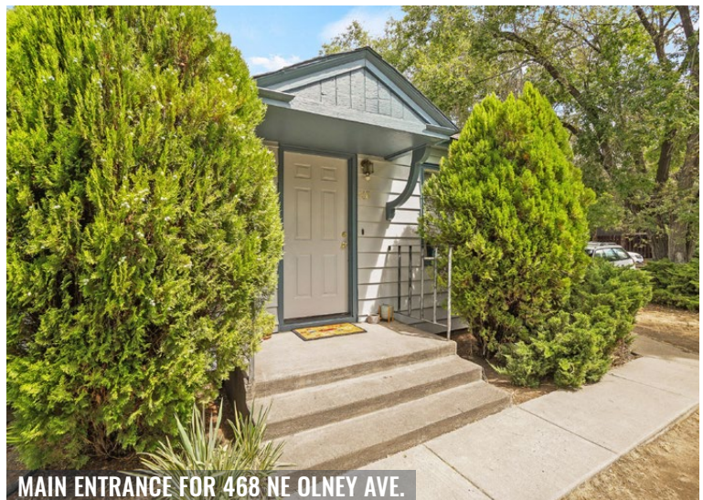
MAIN ENTRANCE FOR 468 NE OLNEY AVE.