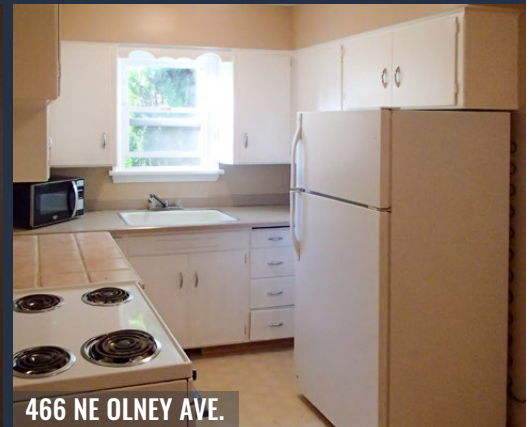
466 NE OLNEY AVE.