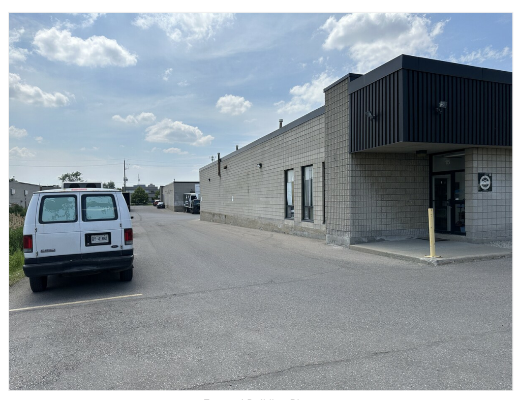
External Building Photo