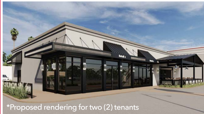
*Proposed rendering for two (2) tenants