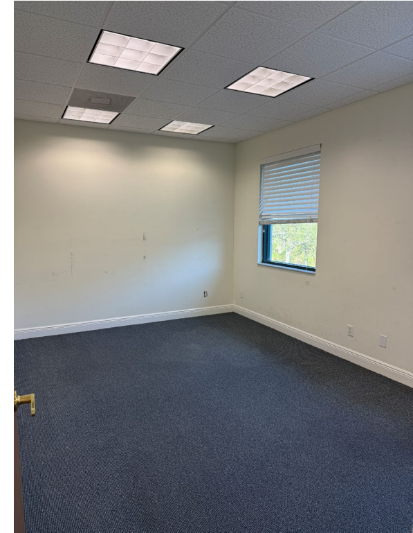
Enclosed Office 2 (11'3" x 15'9")