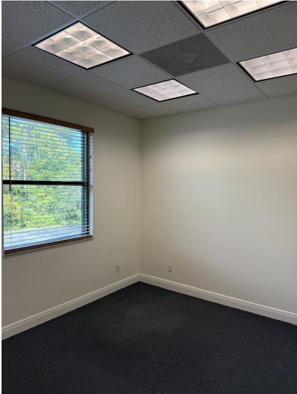
Enclosed Office 1 (11'3" x 10'9")