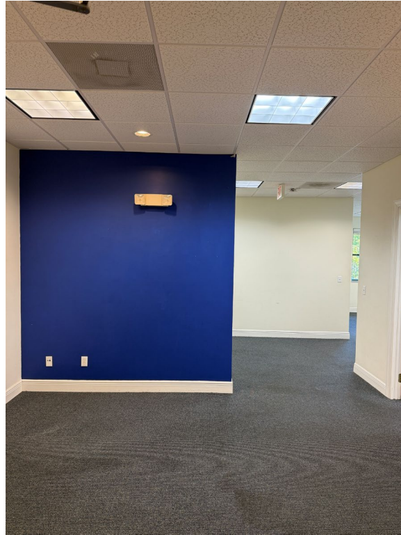
Reception and Open Work Space 1