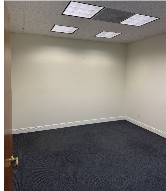
Conference Room (12'3" x 13'3")