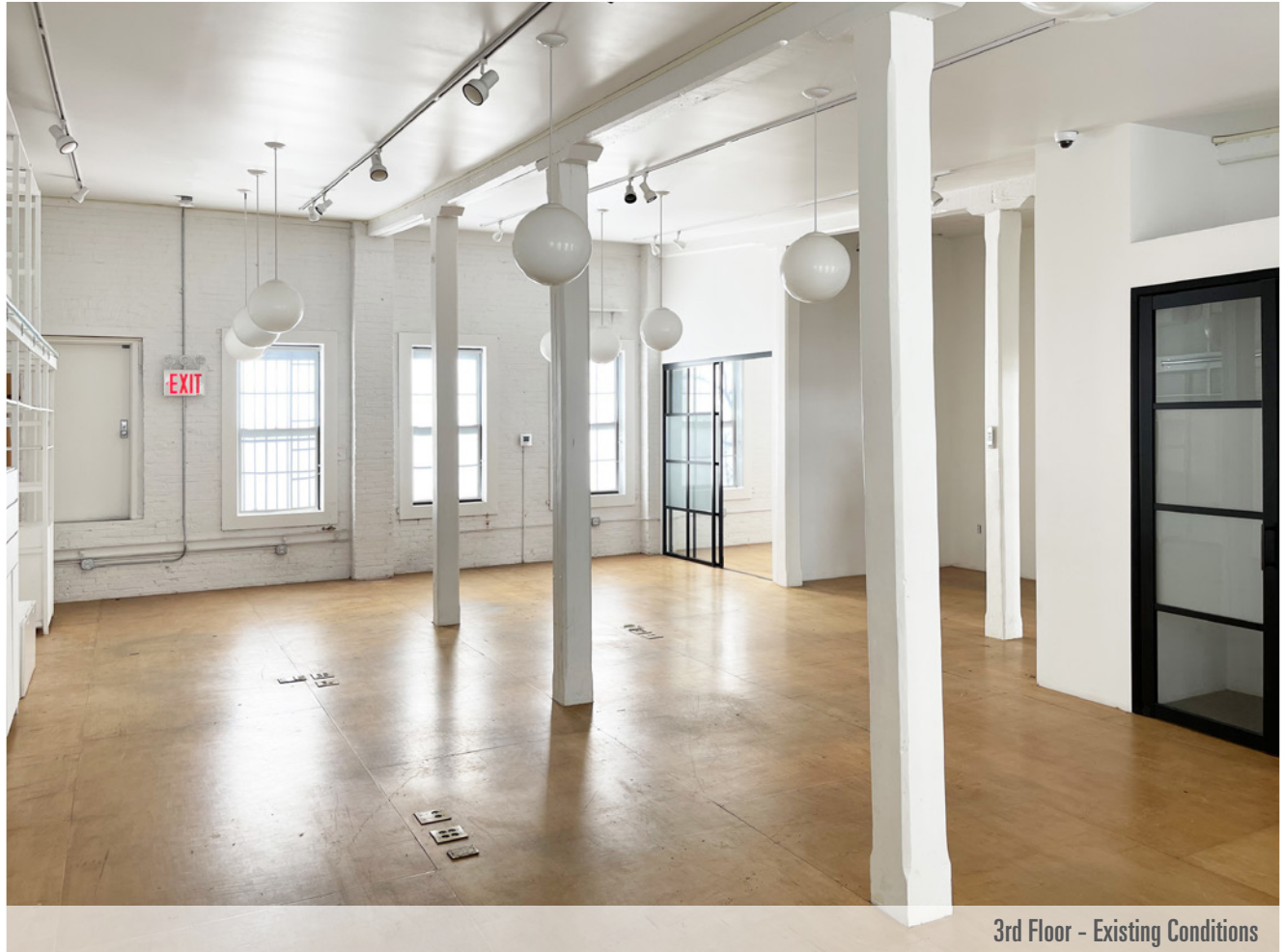
3rd Floor - Existing Conditions

Between Hope Street & Metropolitan Avenue