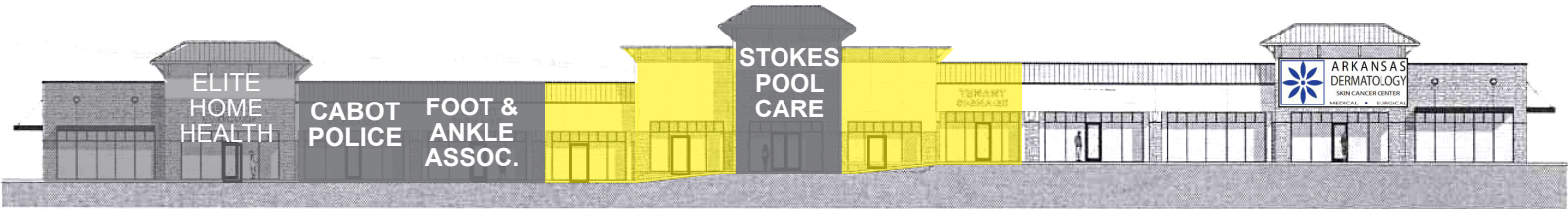
2 EAST ELEVATION 3/32" = 1'-0"