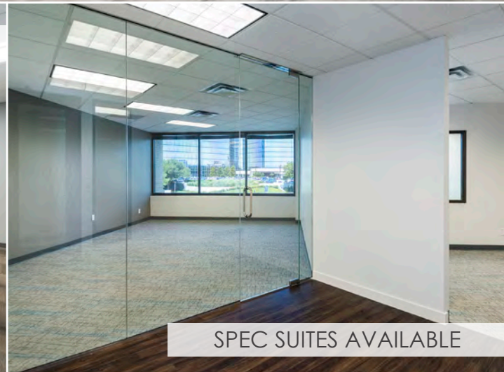
SPEC SUITES AVAILABLE