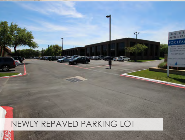
NEWLY REPAVED PARKING LOT