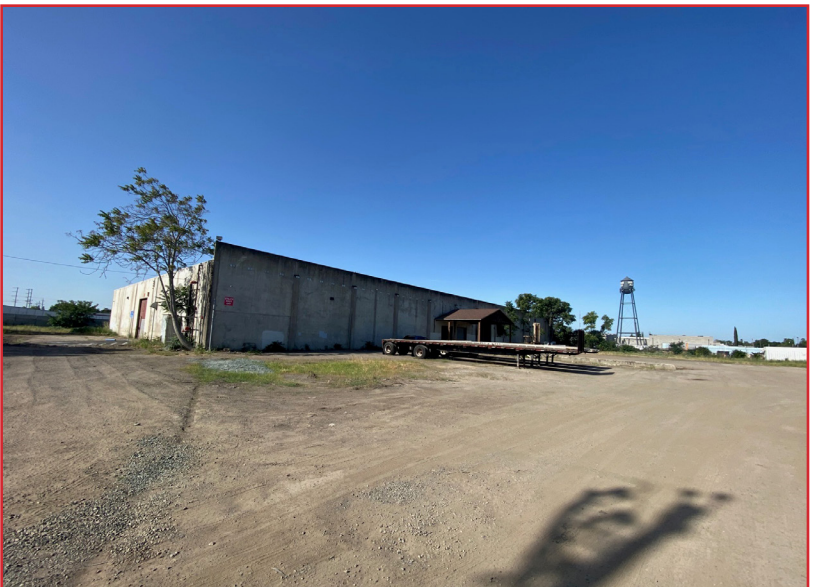
All information furnished regarding property for sale, rental or financing is from sources deemed reliable, but no warranty or representation is made to the accuracy thereof and same is submitted to errors, omissions, change of price, rental or other conditions prior to sale, lease or financing or withdrawal without notice. No liability of any kind is to be imposed on the broker herein.