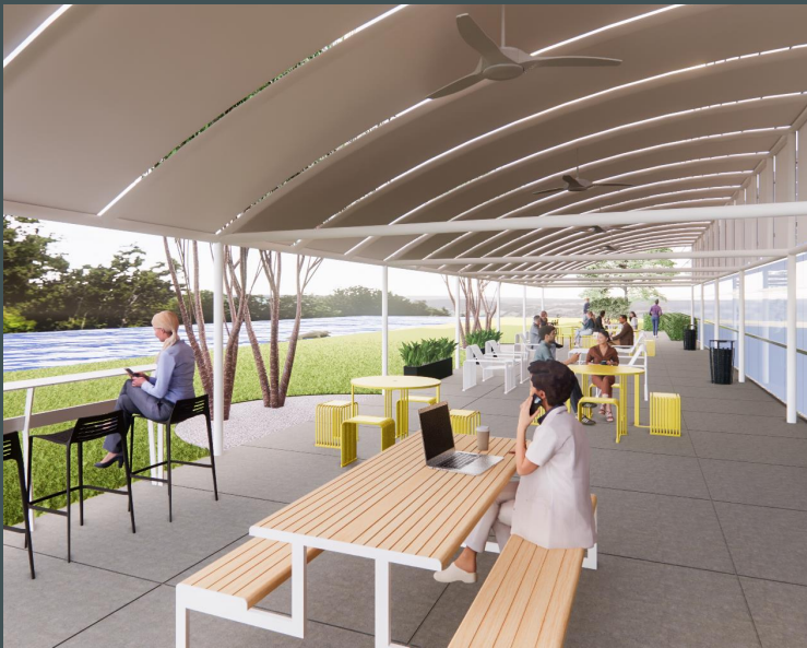
Proposed PATIO Redesign