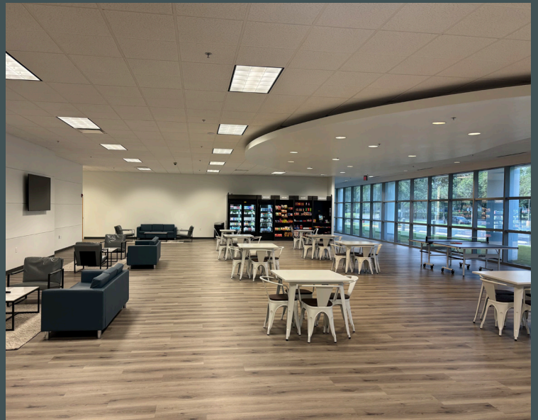
GRAB N GO LOUNGE