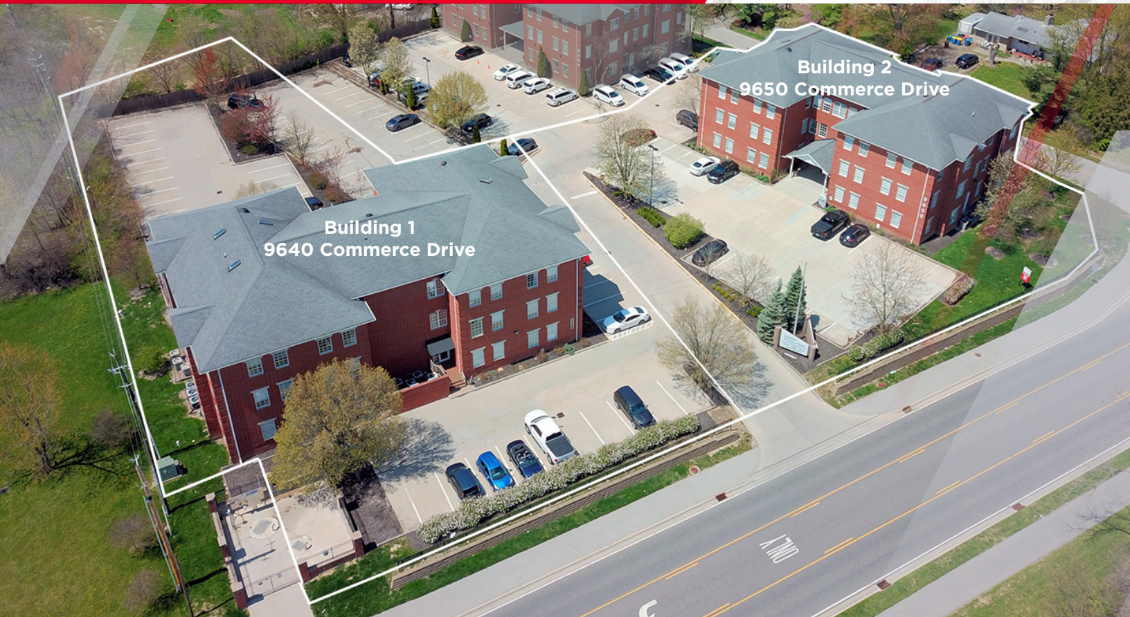
Building 1 9640 Commerce Drive