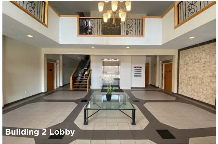
Building 2 Lobby