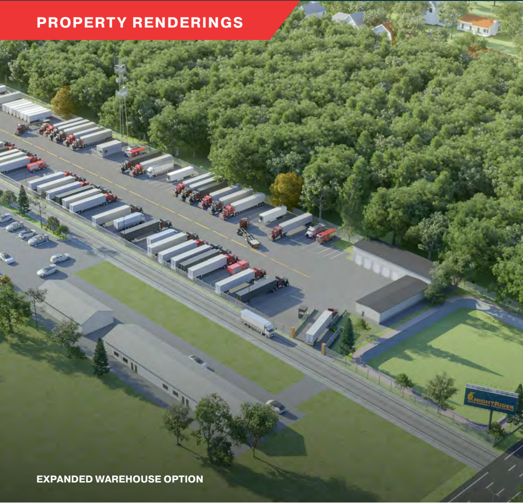
EXPANDED WAREHOUSE OPTION