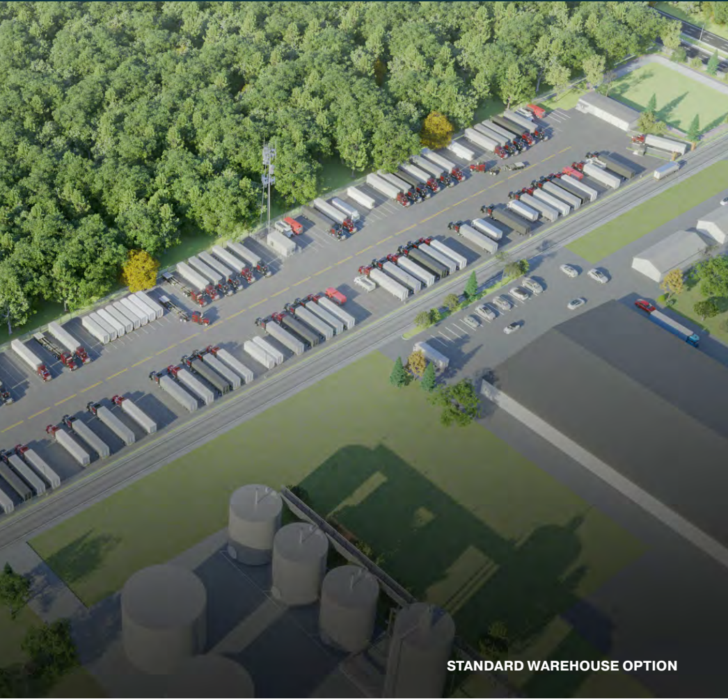
STANDARD WAREHOUSE OPTION