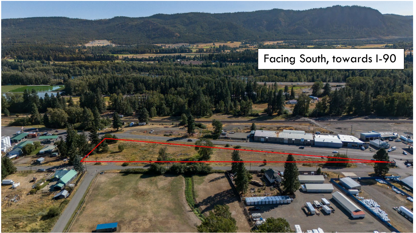
Facing South, towards I-90