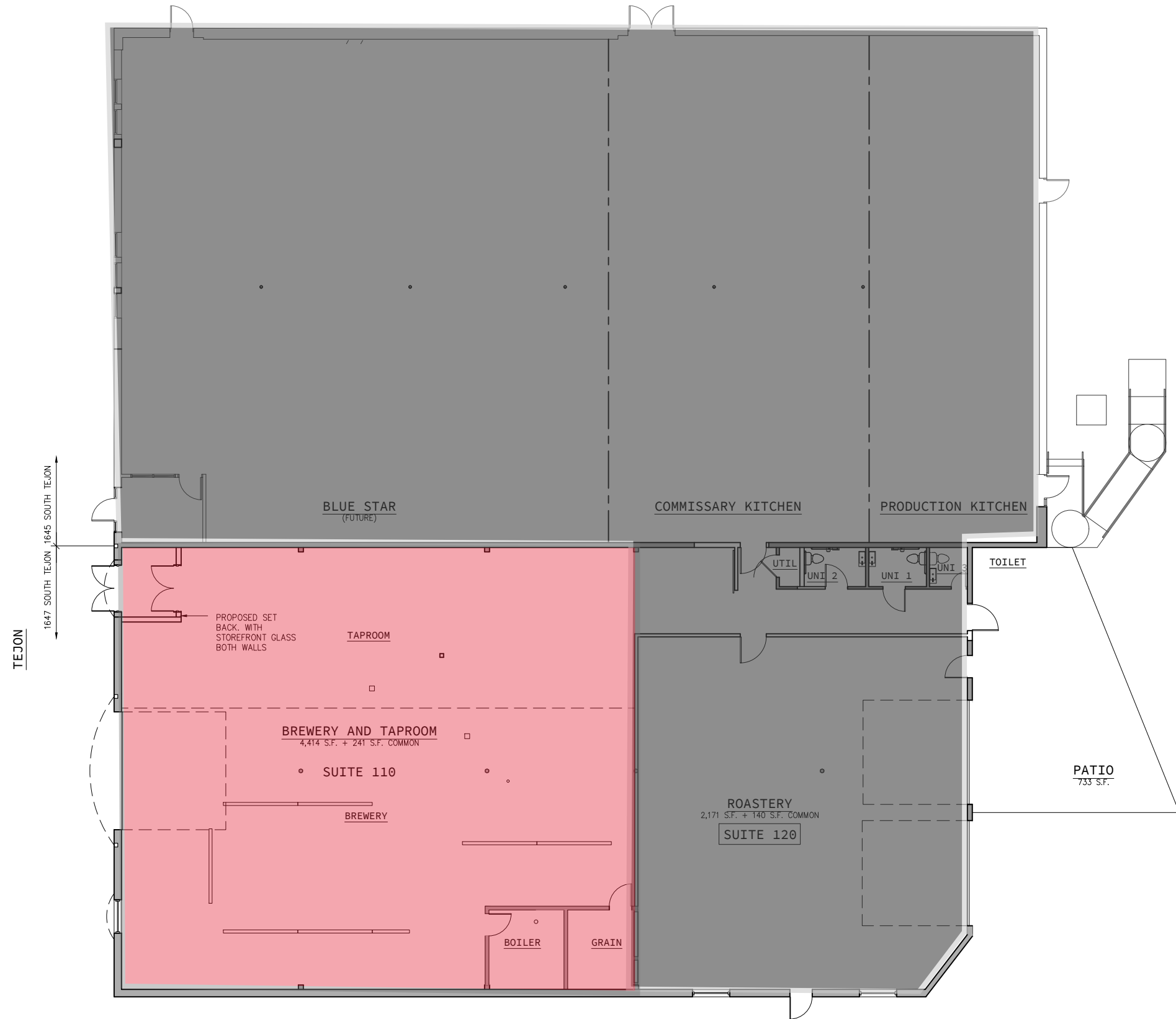
1 1647 & 1645 SOUTH TEJON STREET: EXISTING FLOOR PLAN 1/16" = 1'-0"