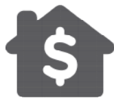
Average HH Income