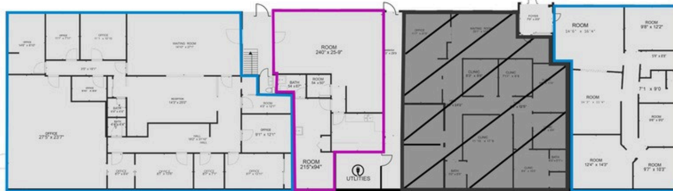
EAST AND WEST WING, MAIN ENTRANCE NORTH