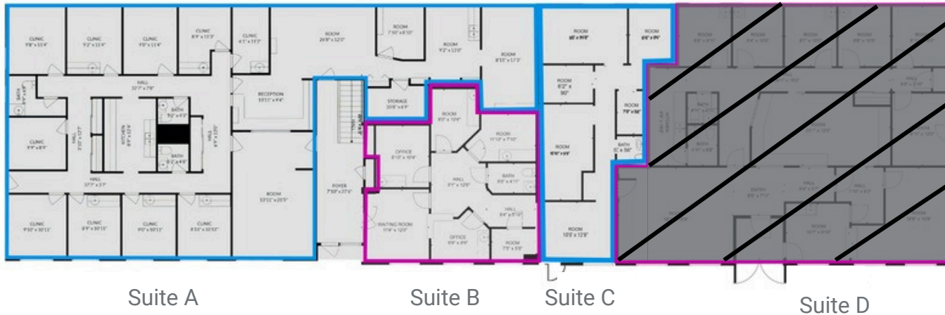
EAST AND WEST WING, MAIN ENTRANCE SOUTH