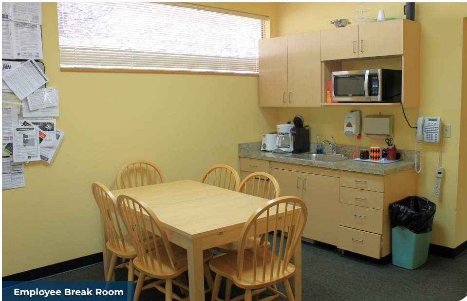
Employee Break Room