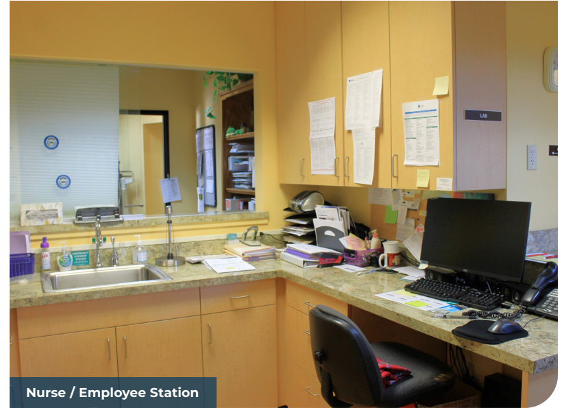
Nurse / Employee Station