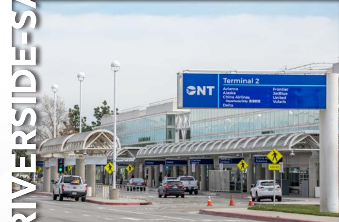
ONTARIO INTERNATIONAL AIRPORT