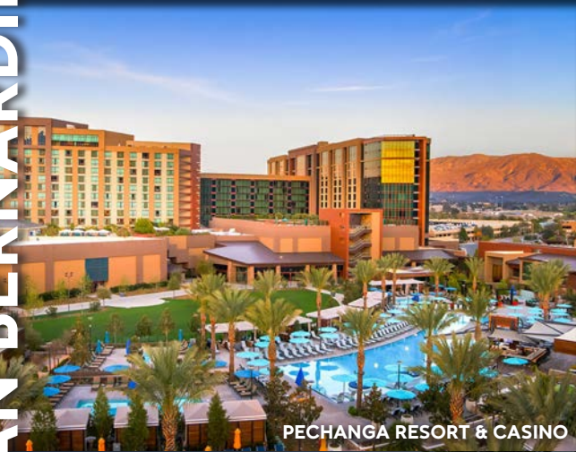
PECHANGA RESORT & CASINO