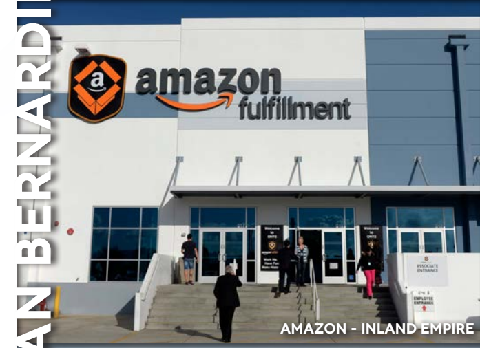
AMAZON - INLAND EMPIRE