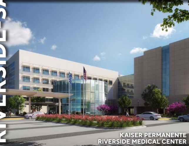
KAISER PERMANENTE RIVERSIDE MEDICAL CENTER