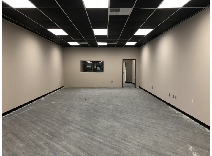
2921 General retail 1,500 sf