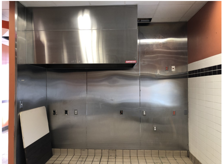
2922 Carry out with drive thru 1,500 sf

Information herein has been obtained from sources believed to be reliable. While we do not doubt its accuracy, we have not verified it and make no guarantee, warranty or representation about it. References to square footage or age are approximate. Any information of special interest should be obtained through independent verification. Buyer or Tenant bears all risk for any inaccuracies.