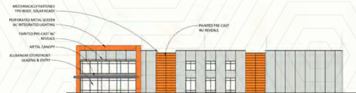
EAST ELEVATION 3/64" = 1'-0"