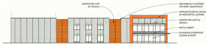
WEST ELEVATION 3/64" = 1'-0"