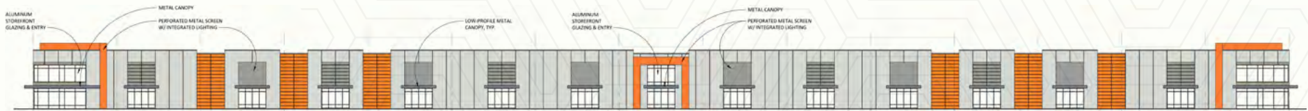
SOUTH ELEVATION 3/64" = 1'-0"