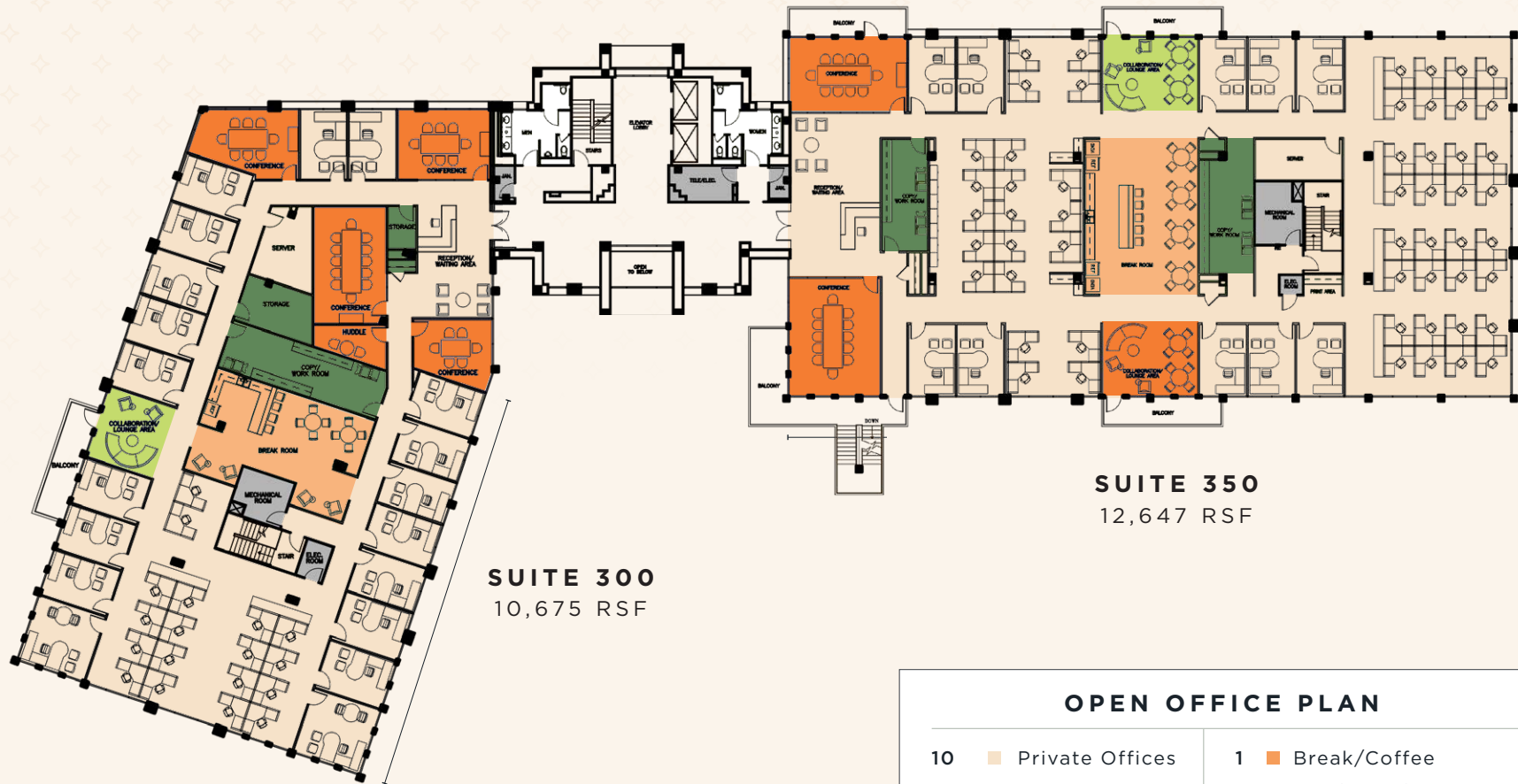
SUITE 300 10,675 RSF