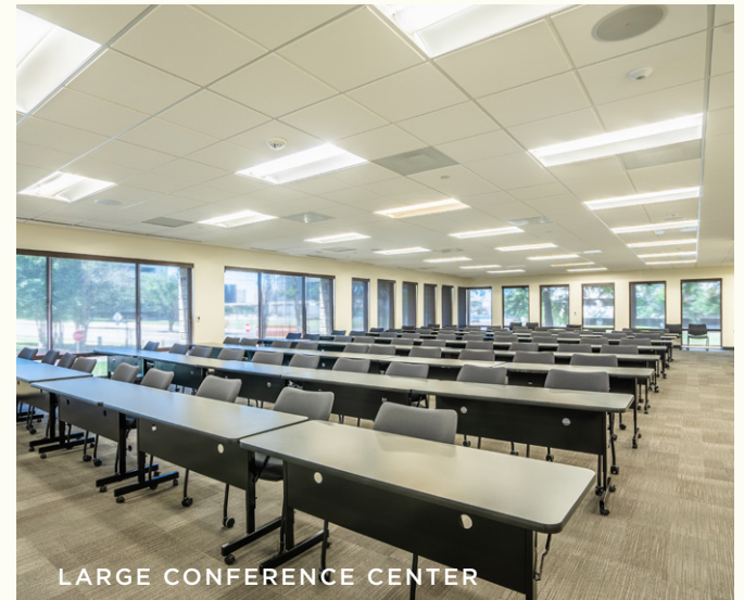
LARGE CONFERENCE CENTER