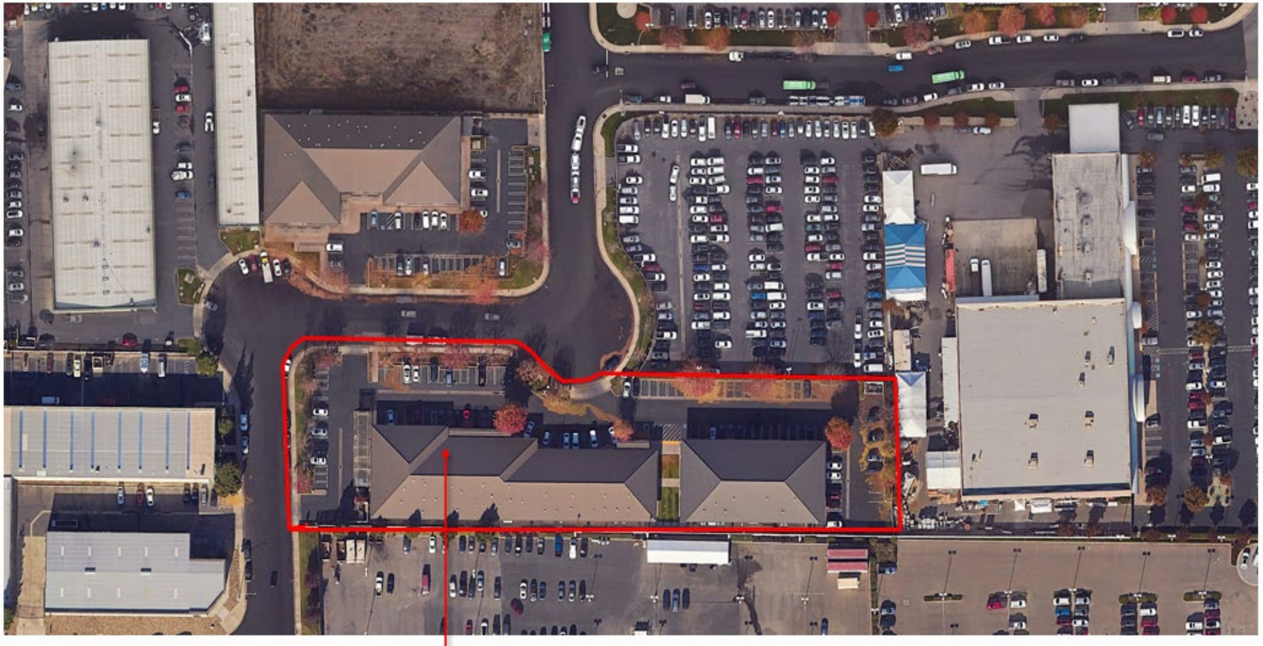
AERIAL PHOTOGRAPHY | 4640 SPYRES WAY, MODESTO