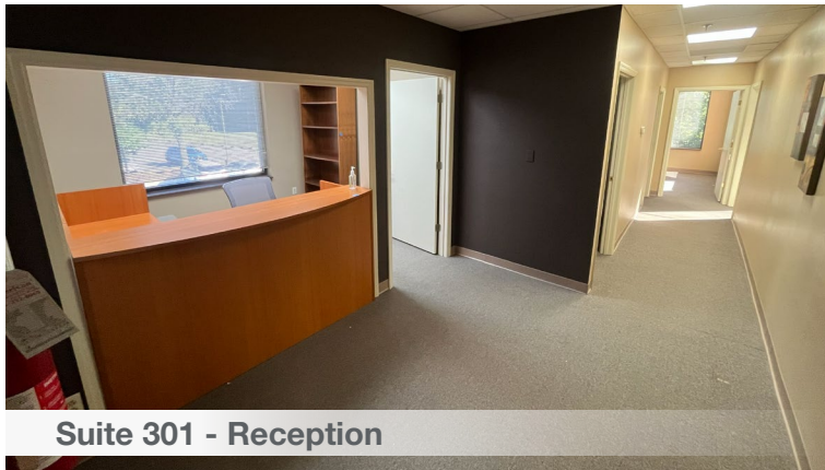
Suite 301 - Reception