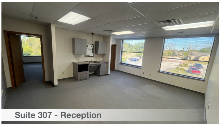
Suite 307 - Reception