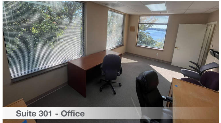
Suite 301 - Office