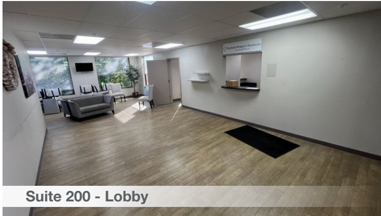
Suite 200 - Lobby