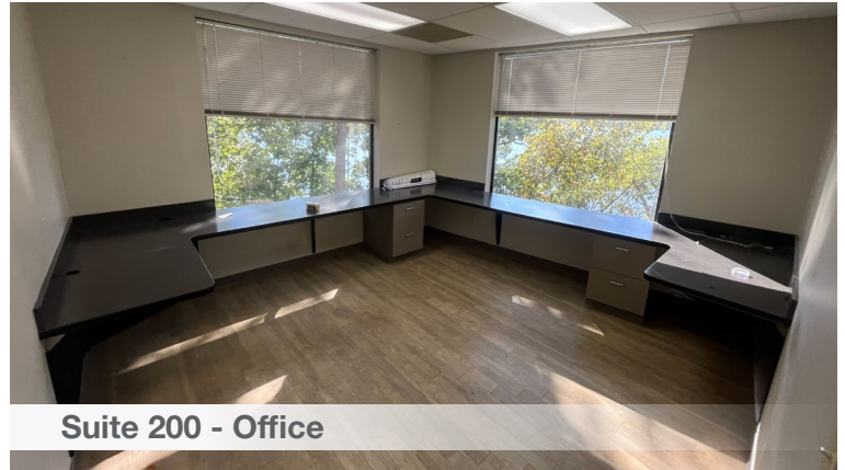
Suite 200 - Office