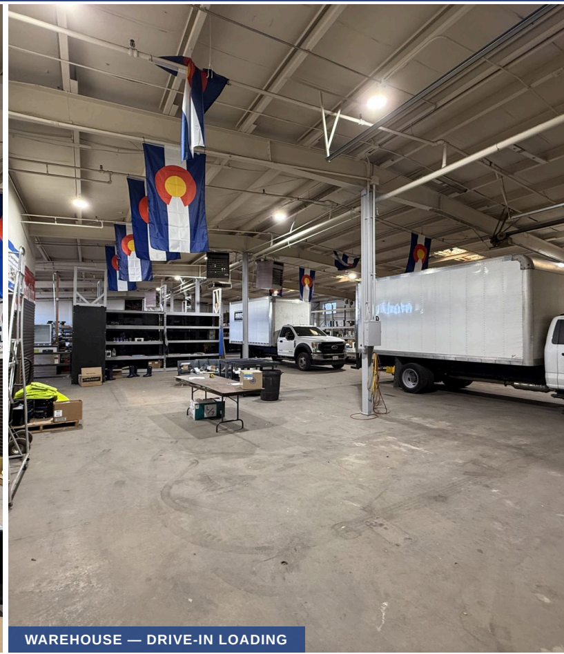
WAREHOUSE — DRIVE-IN LOADING