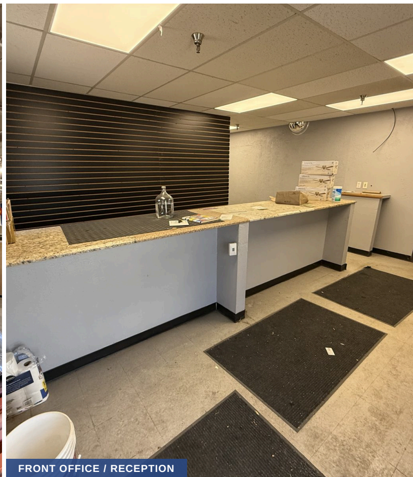
FRONT OFFICE / RECEPTION