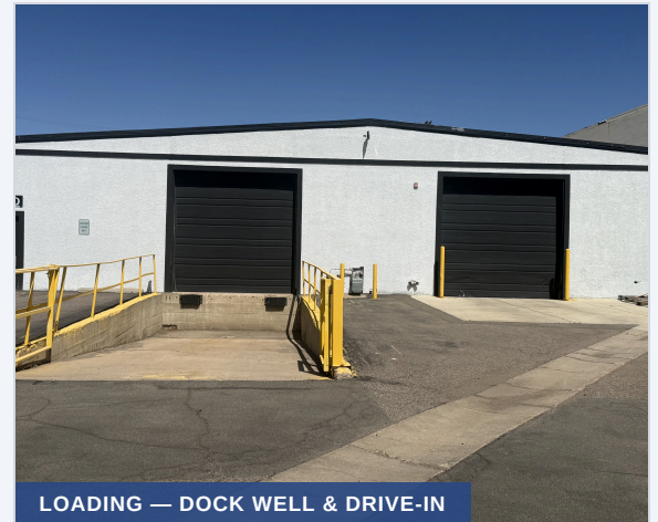
LOADING — DOCK WELL & DRIVE-IN