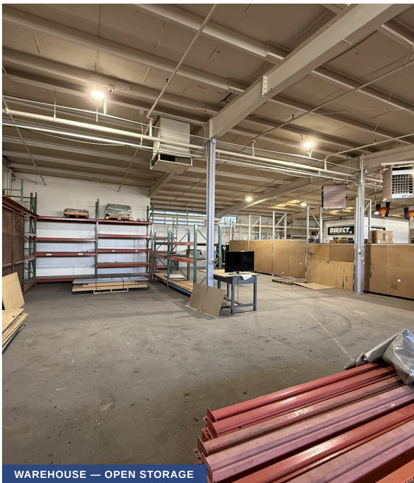
WAREHOUSE — OPEN STORAGE