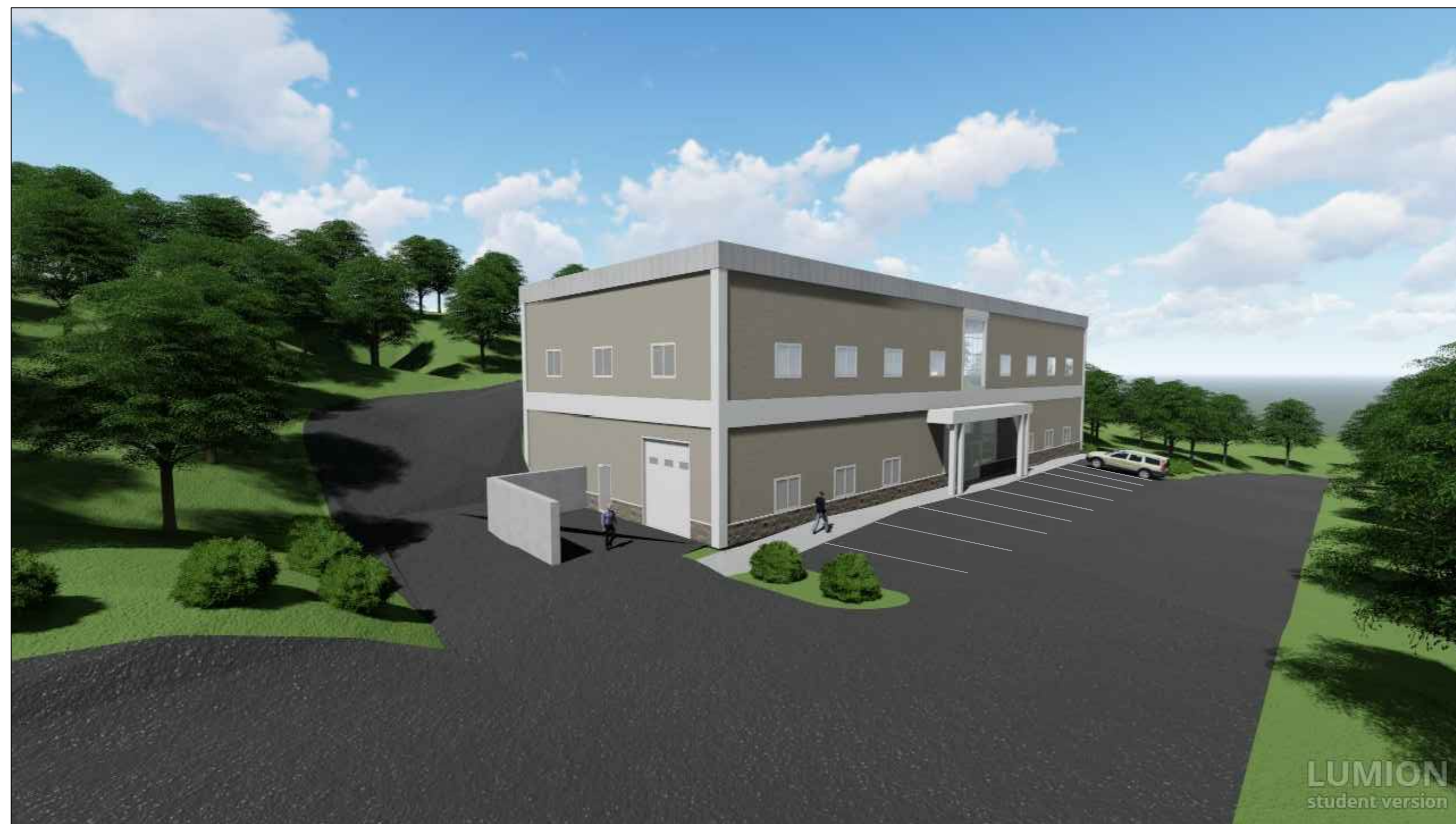
③ FRONT VIEW – WEST