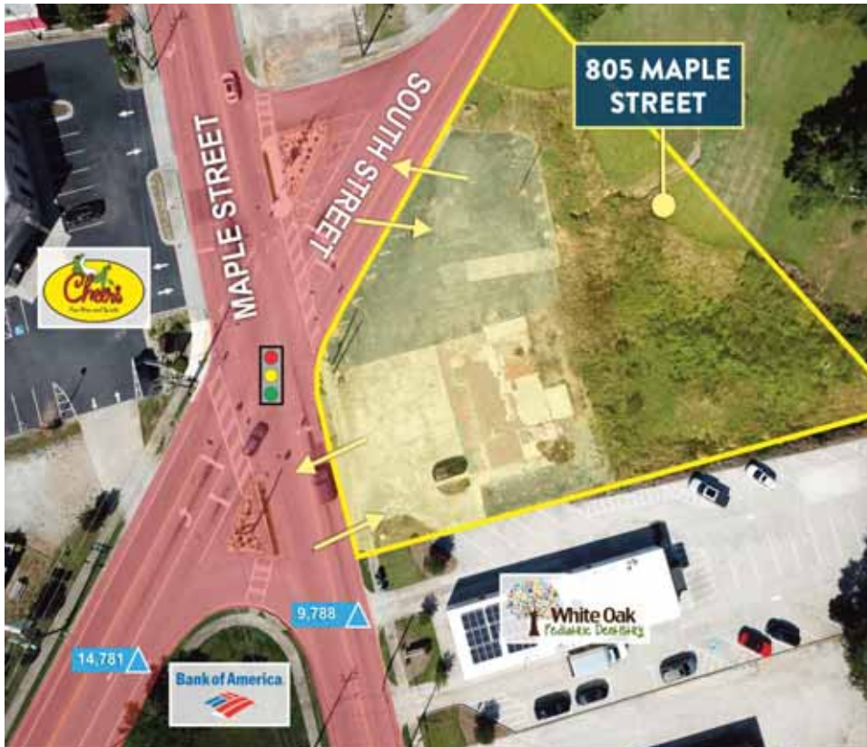
805 Maple Street | Carrollton, Georgia 30117