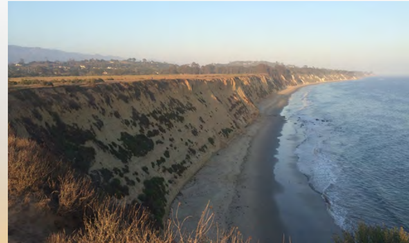
The More Mesa Loop Trail

The South Coast region's central location, year-round mild climate, proximity to the University of California, Santa Barbara (UCSB), high quality of living, bustling technology industry and wealth of outdoor amenities are but a few of the reasons Santa Barbara and Goleta are regularly selected among the best places to live and work by numerous sources including livability.com, Money Magazine and Sunset Magazine.