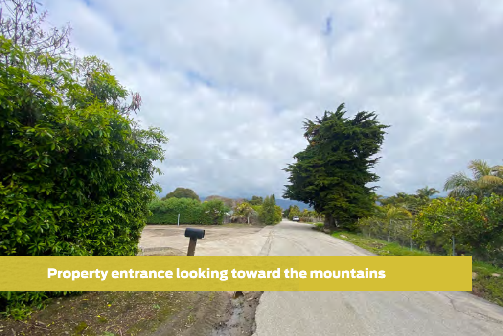
Property entrance looking toward the mountains