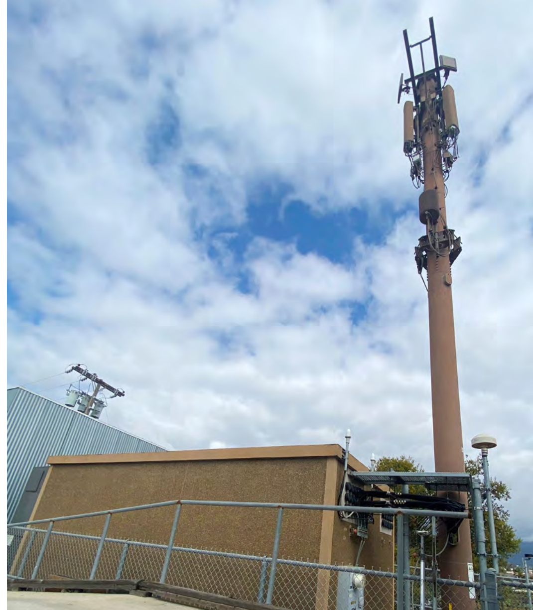
Cell site & loading ramp shown above. There is currently an offer to buy out the cell tower lease for $625,000, which a new owner could potentially use to their advantage.