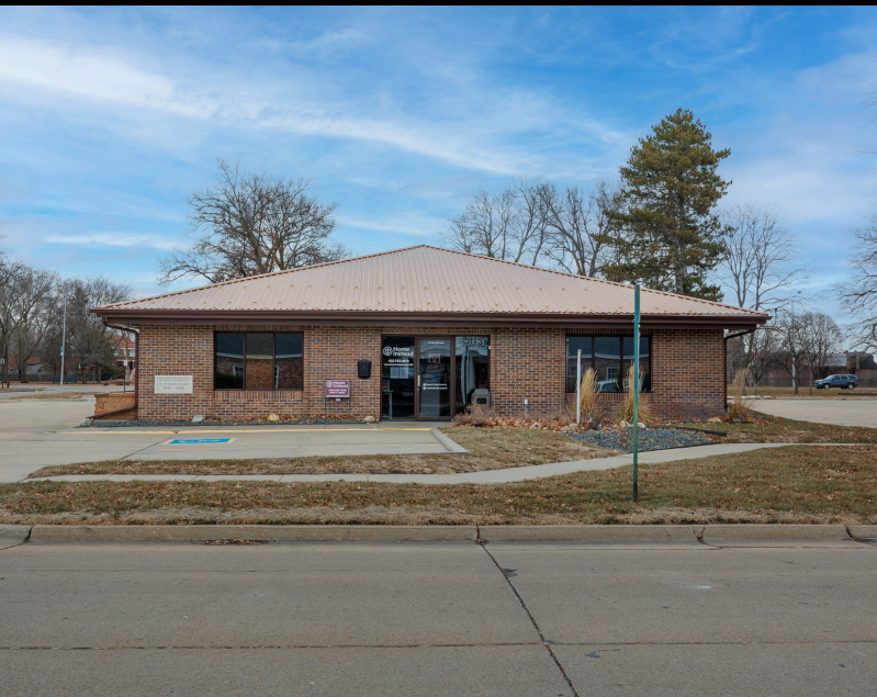
220 EAST 22ND STREET, FREMONT, NE 68025, US