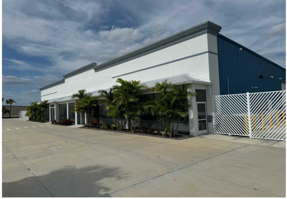
Your paragraph tex