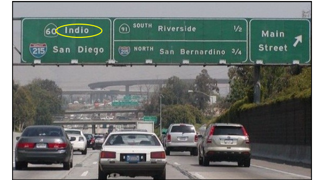
#60 Pomona Freeway eastbound from L.A. and Orange County into Riverside at I-#215 freeway interchange, east to Indio.