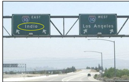
#210 Foothill Freeway east out of San Fernando Valley, Pasadena & San Gabriel Valley to I-#10 Freeway interchange in Redlands, east to Indio.