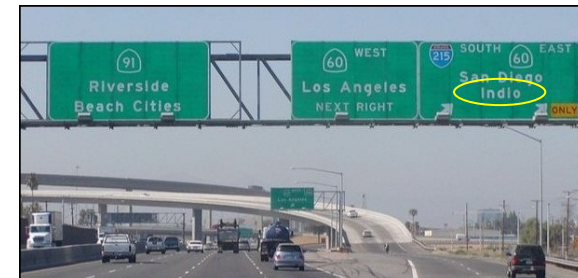
Interstate #215 southbound into Riverside from San Bernardino, Barstow and Las Vegas at CA #60 and #91 freeways, east to Indio.