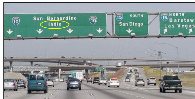
Interstate #10 San Bernardino Freeway eastbound from LA, San Gabriel Valley and Pomona at I-#15 interchange in Ontario, east to Indio.