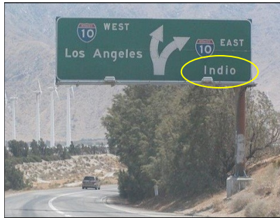
29 Palms #62 Highway westbound at I-10 interchange at west end of Palm Springs Resorts Valley, east of Indio.