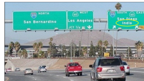
Riverside Freeway #91 east from Orange County into Riverside at I-#215 & CA-#60 freeway interchanges, east to Indio.