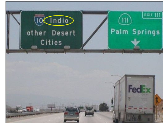
Interstate #10 San Bernardino Freeway eastbound into the Coachella Valley from San Bernardino, Redlands and Riverside to Indio.