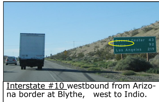
Interstate #10 westbound from Arizona border at Blythe, west to Indio.