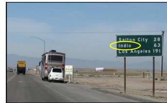
#86 Hwy, the NAFTA Hwy, northbound from El Centro and Mexicali to the I-#10 in Indio.