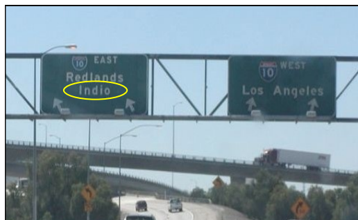
Interstate #15 Freeway southbound from San Bernardino, Barstow, and Las Vegas in Ontario at I-#10 Freeway interchange, east to Indio.