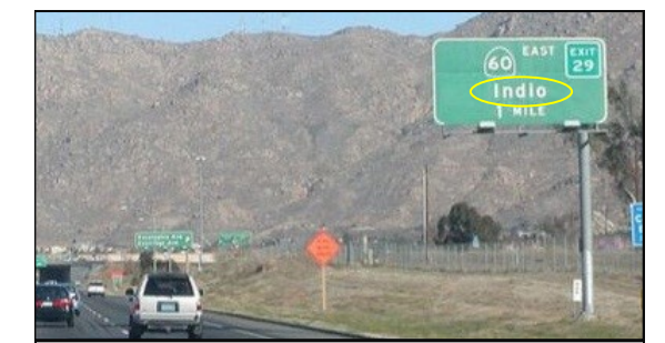
Interstate #215 Escondido Freeway northbound from Temecula, Escondido and San Diego into Riverside- exit to Indio on eastbound CA-#60 Moreno Valley Freeway.