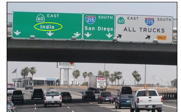
Interstate #215 Escondido Freeway southbound out of Riverside at CA-#60 Moreno Valley Freeway interchange, east to Indio.