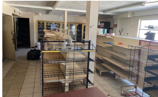
Interior Convenience Store