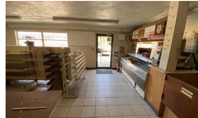
Interior Convenience Store