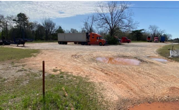
Tractor Trailer Parking