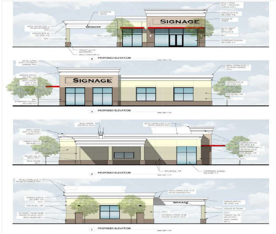
B100 2372 sf with Drive-thru