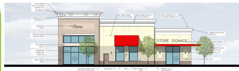
B400 5850 sf up to 2 Users