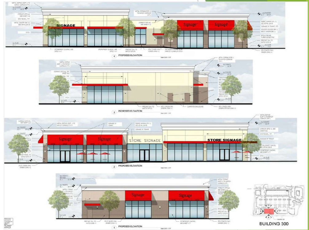
B300 8950 SF up to 3 Users