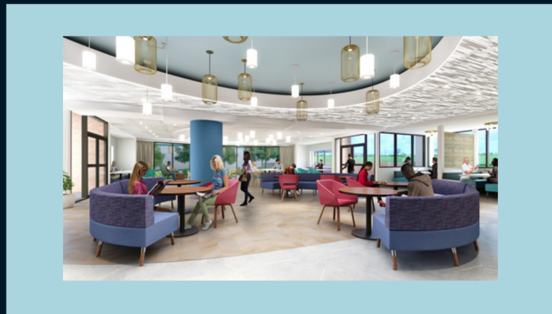
Social Cafe in Building B