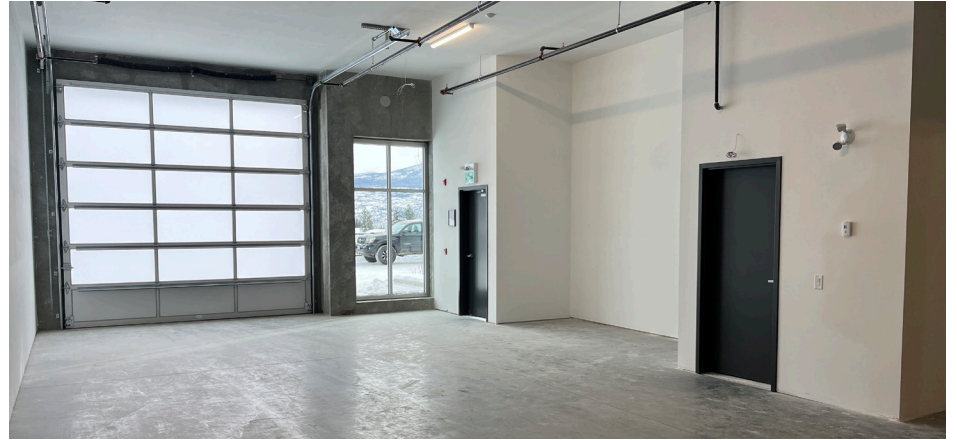
PROJECT: 105 - 3100 CARRINGTON